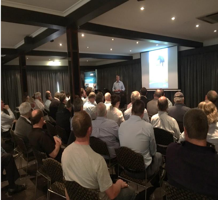
Attendees at the ANZ Seminar in Mt Gambier

A recently released report from the BankSA Trends Report (done in conjunction with Deloitte Access Economics) predicted that, South Australia’s food and agriculture industry could become the largest employer in the state, with the demand for premium food both domestically and internationally, set to increase enormously in the coming decade”.