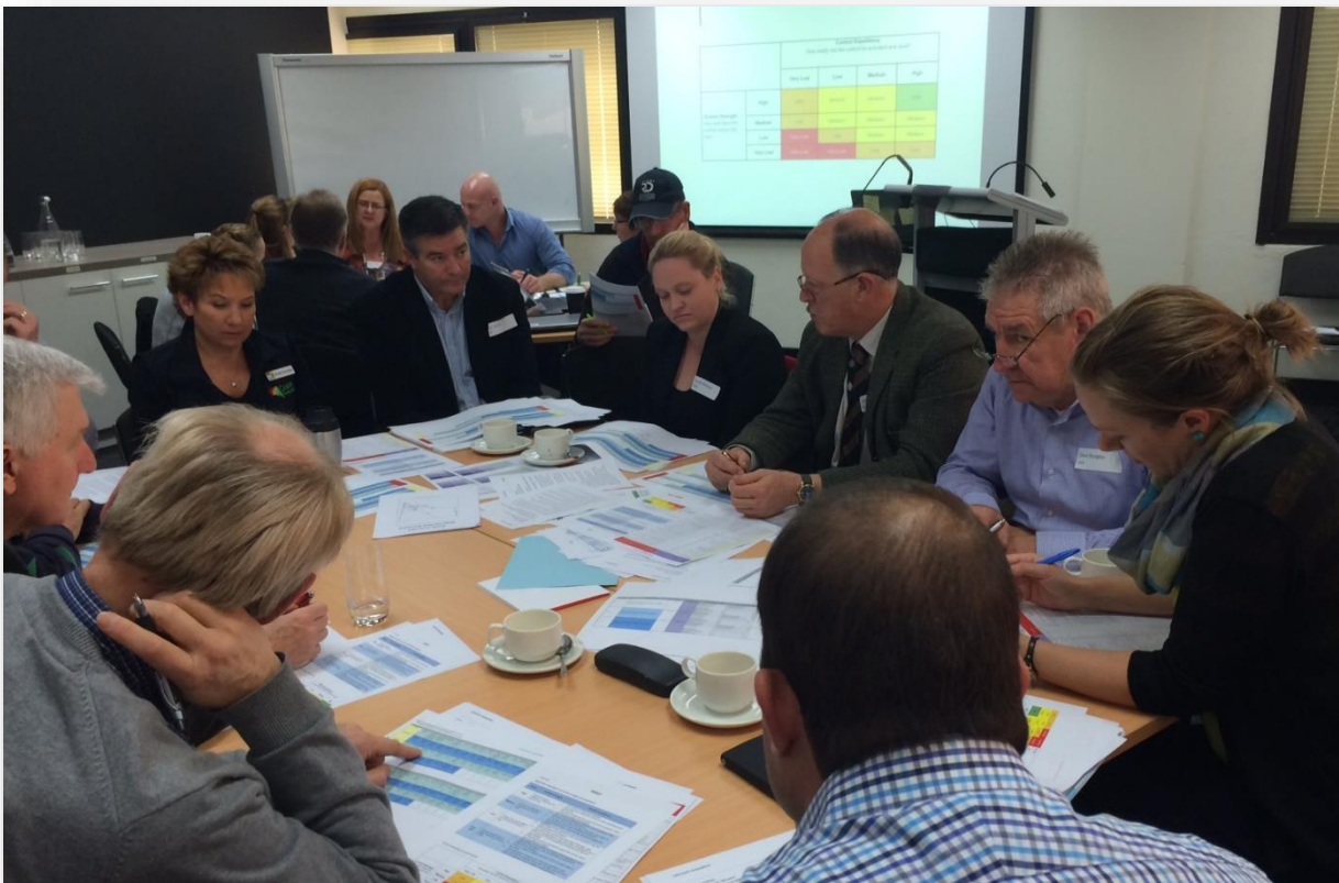
PIRSA Drought Workshop

PIRSA called a major stakeholder meeting reviewing all aspects of managing drought events on Thursday 30 July.