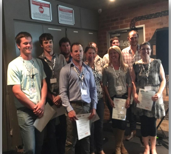
Dairy Bootcamp Group